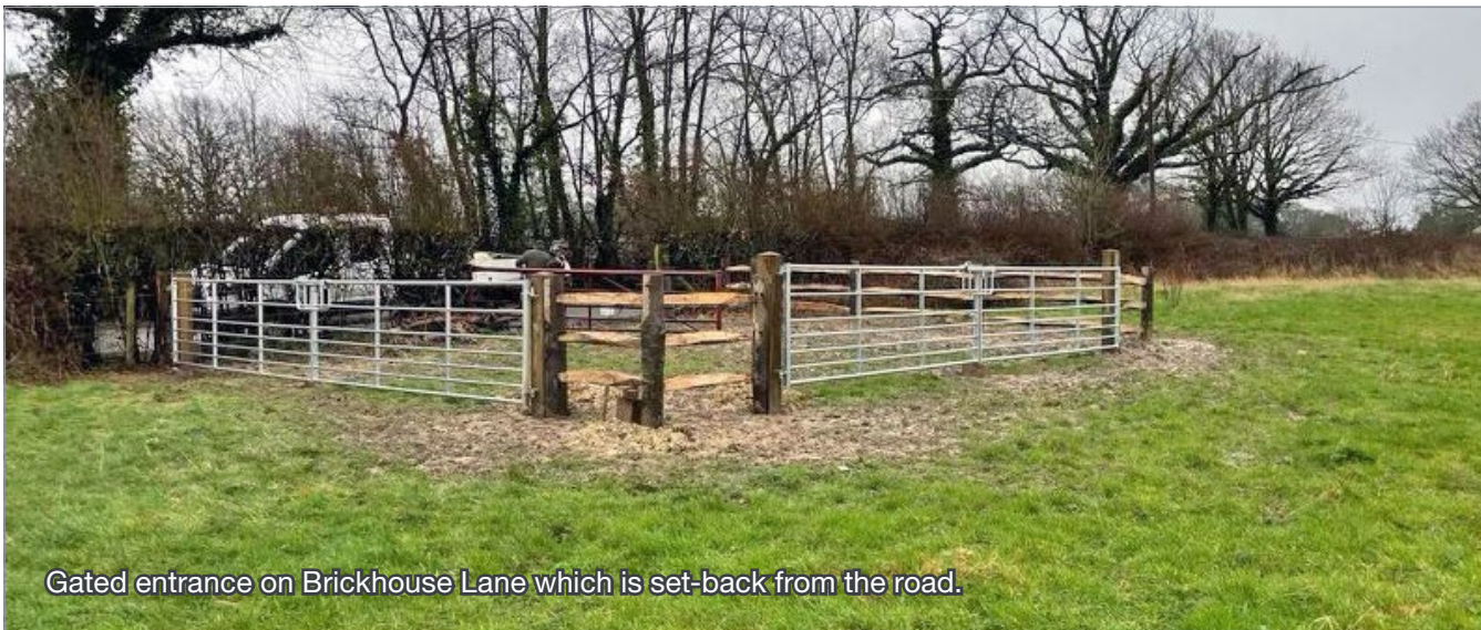
Gated entrance on Brickhouse Lane which is set-back from the road.

Vantage Land Limited has produced these particulars in good faith but cannot guarantee total accuracy. Sizes and distances are approximate. Purchasers should verify any detail of importance prior to viewing and purchase. The particulars are not an offer or contract. Comments made in general advertising may not apply to this particular property and of course planning permission cannot be guaranteed.