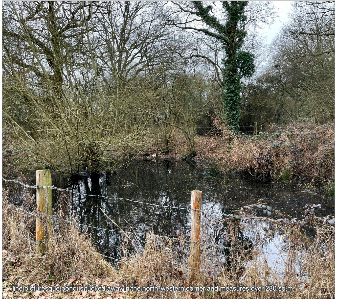
The picturesque pond is tucked away in the north-western corner and measures over 280 sq.m.

For the golfing enthusiast, Horne Park, Copthorne & Chartham Park golf courses are all nearby.