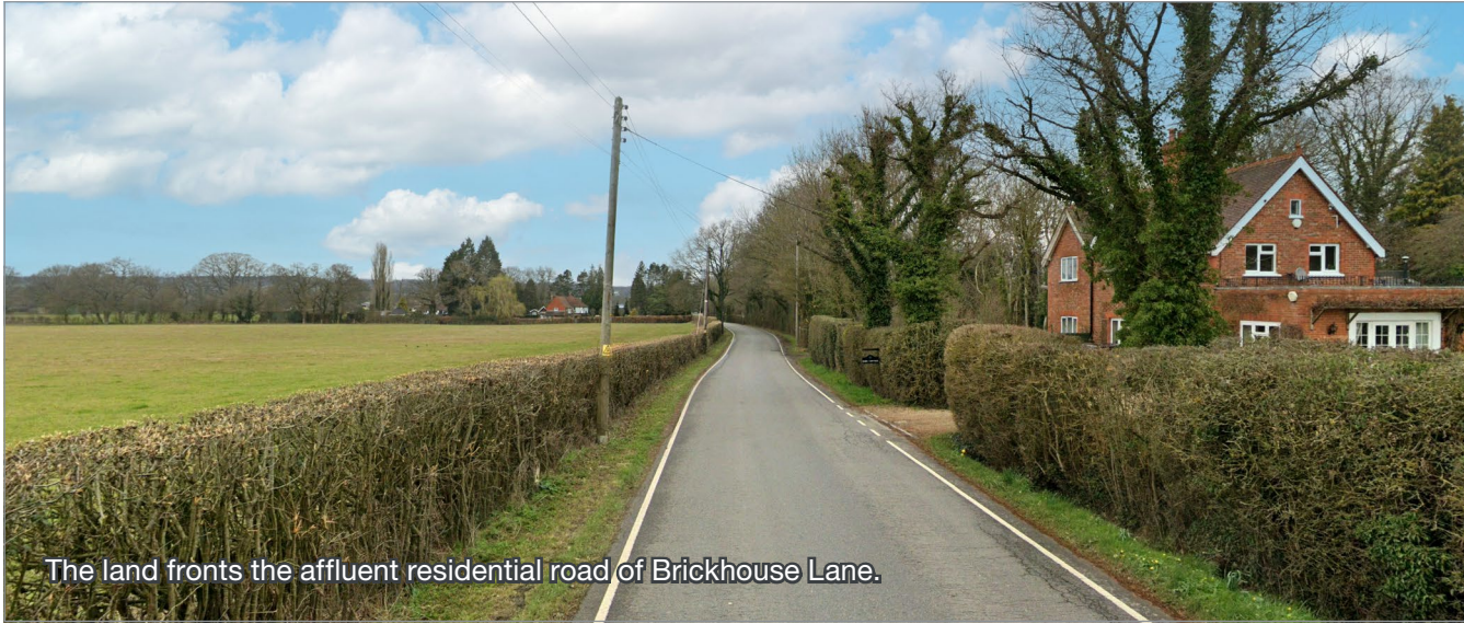
The land fronts the affluent residential road of Brickhouse Lane.