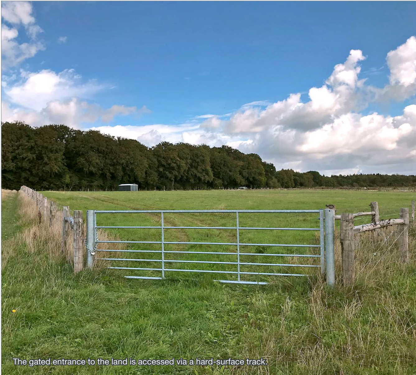
The gated entrance to the land is accessed via a hard-surface track.