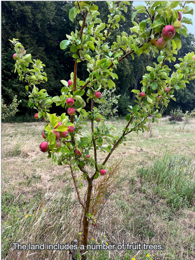
The land includes a number of fruit trees.