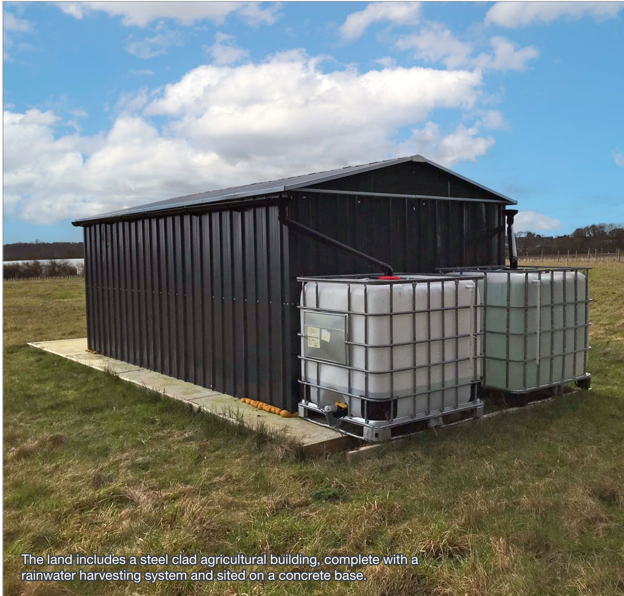
The land includes a steel clad agricultural building, complete with a rainwater harvesting system and sited on a concrete base.