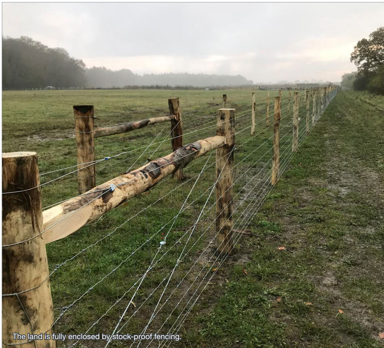
The land is fully enclosed by stock-proof fencing.

These rises are driven by historically low levels of land availability, as demand continues to outstrip supply.