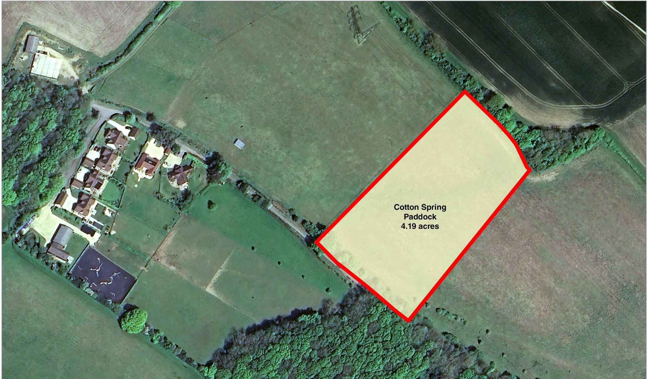
Cotton Spring Paddock 4.19 acres