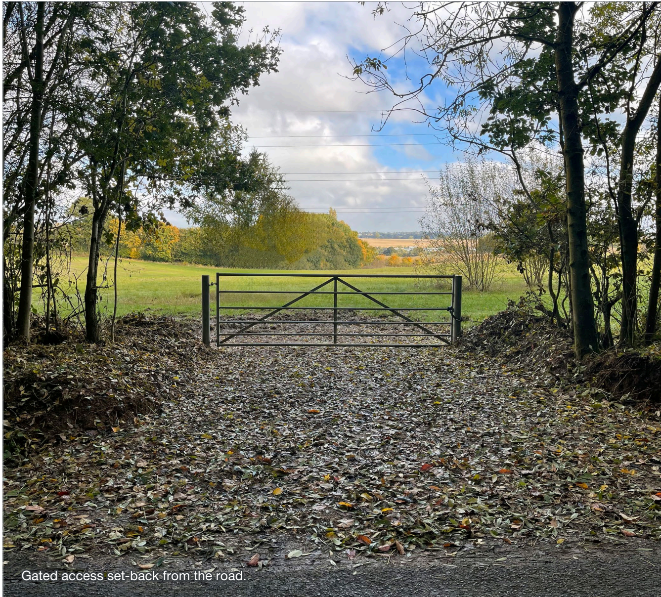
Gated access set-back from the road.