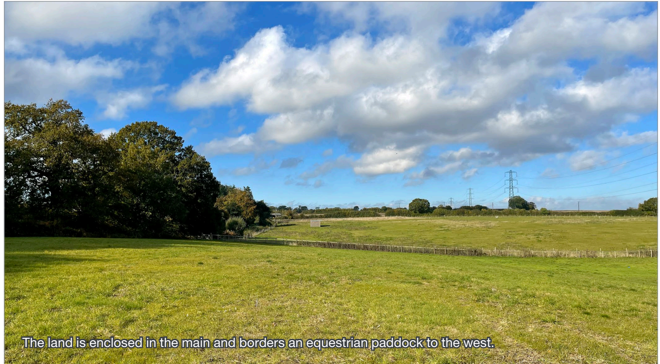
The land is enclosed in the main and borders an equestrian paddock to the west.

These premium house prices reflect the desirability of the area as a place to live and own property – including land.