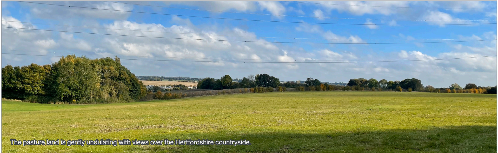
The pasture land is gently undulating with views over the Hertfordshire countryside.