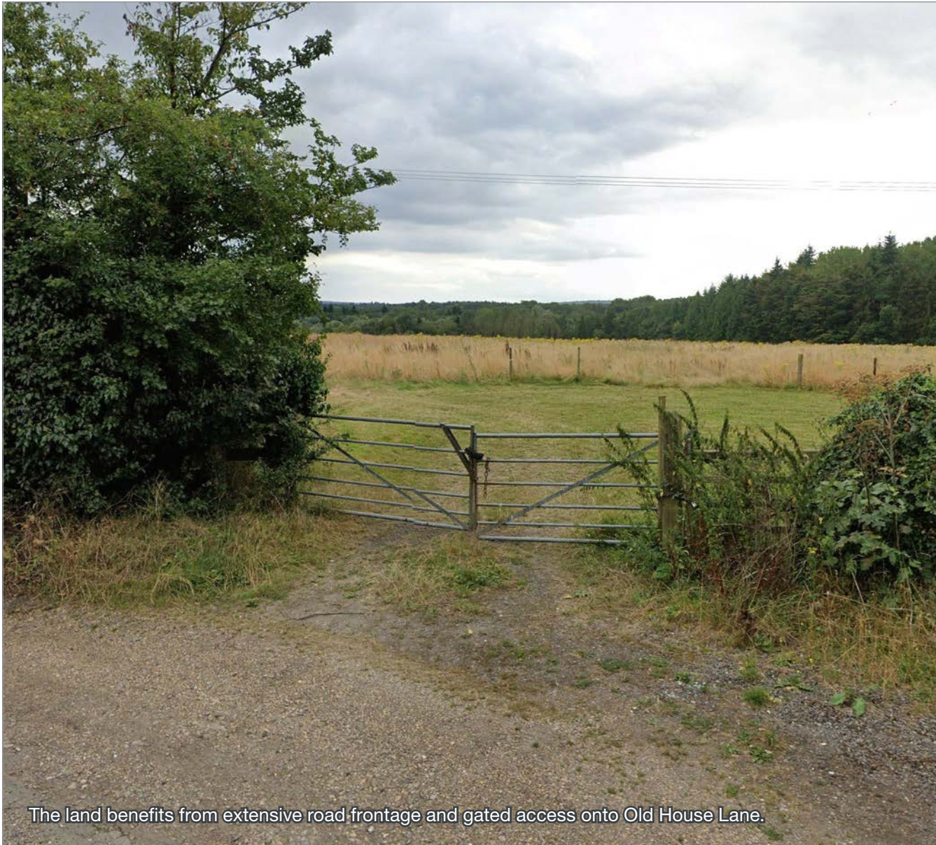
The land benefits from extensive road frontage and gated access onto Old House Lane.