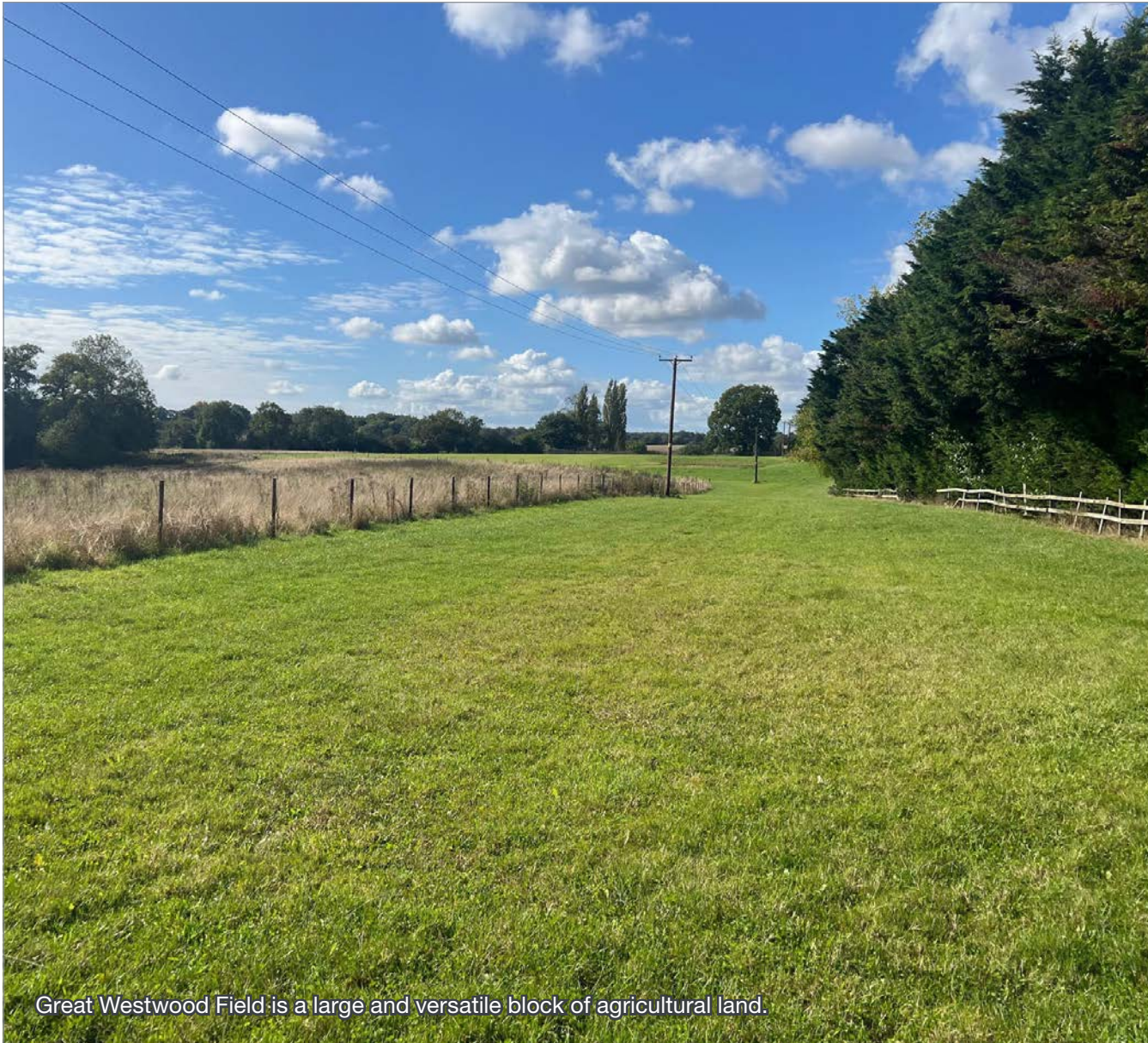
Great Westwood Field is a large and versatile block of agricultural land.