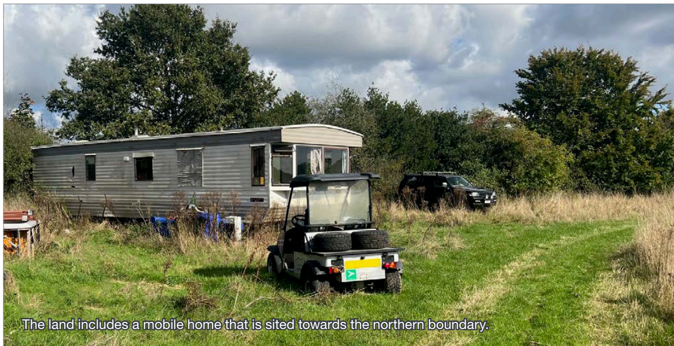
The land includes a mobile home that is sited towards the northern boundary.

Three Rivers District Council www.threerivers.gov.uk