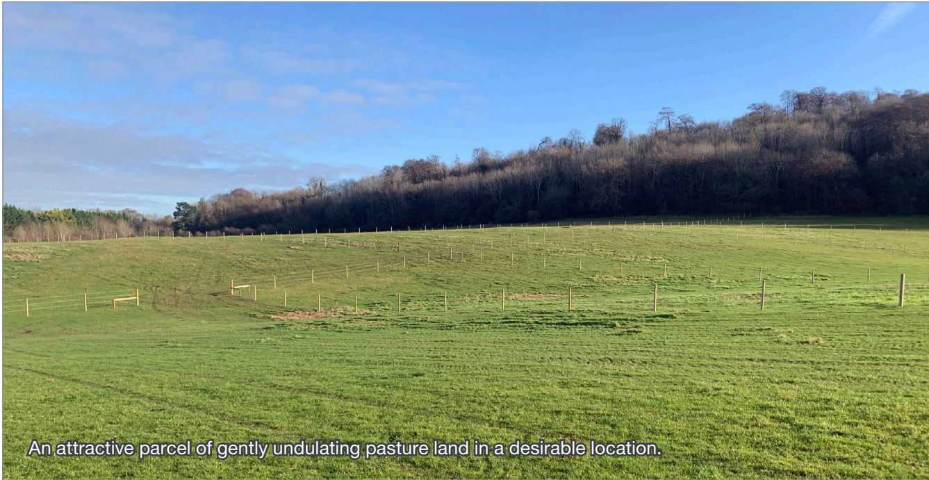
An attractive parcel of gently undulating pasture land in a desirable location.