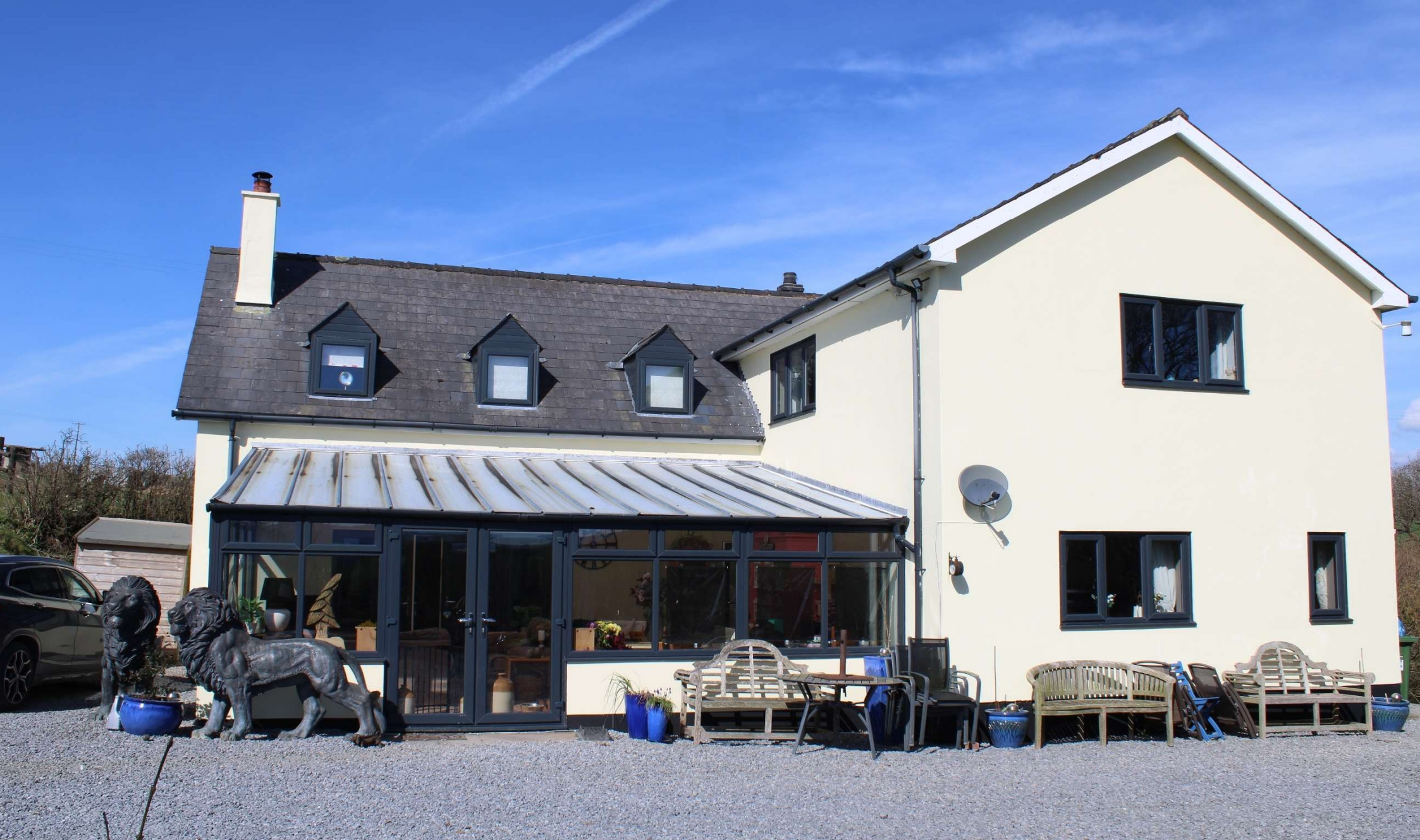
SPITE HOUSE Henllan Amgoed, Whitland, SA34 0SR